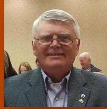
GOVERNOR ELECT Jim Greene Club: Anaconda