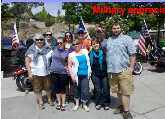
Military appreciation day project., Day of Charter